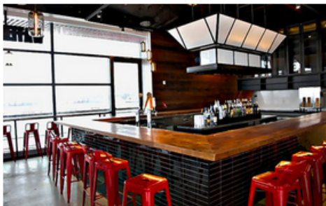
Watermark Bar interior

After Sandy delays opening, Watermark Bar & Lounge finally opens Thursday!