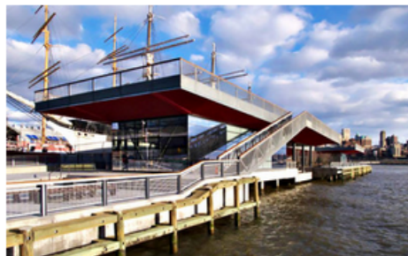
Watermark Exterior

The venture, a partnership between Merchant's Hospitality and The Lure Group , aims to improve the already attractive waterfront through an upscale, yet serene bar and lounge atmosphere where guests will enjoy a gorgeous panorama of the New York Harbor, Brooklyn Bridge, and the Seaport's historic vessels docked nearby. The stunning 3,500 square-foot venue boasts a structure made up of steel and glass with floor-to-ceiling windows seamlessly separating its indoor and outdoor spaces, allowing guests to enjoy the wonderful waterfront views all year long.